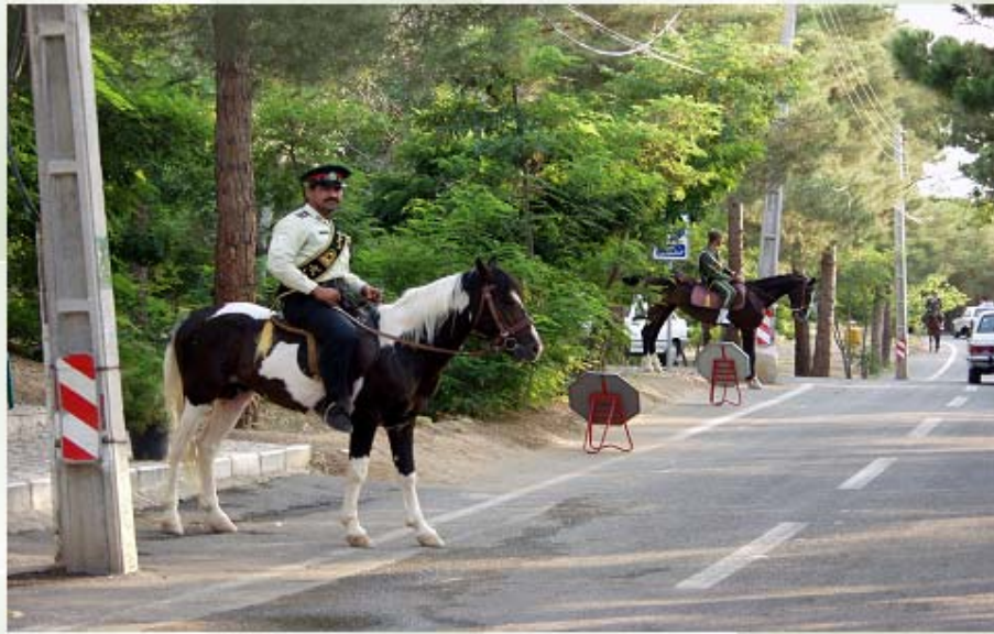
(Tehran, Chitgar Park)

Recording of the information from member countries and other subscribes issues.