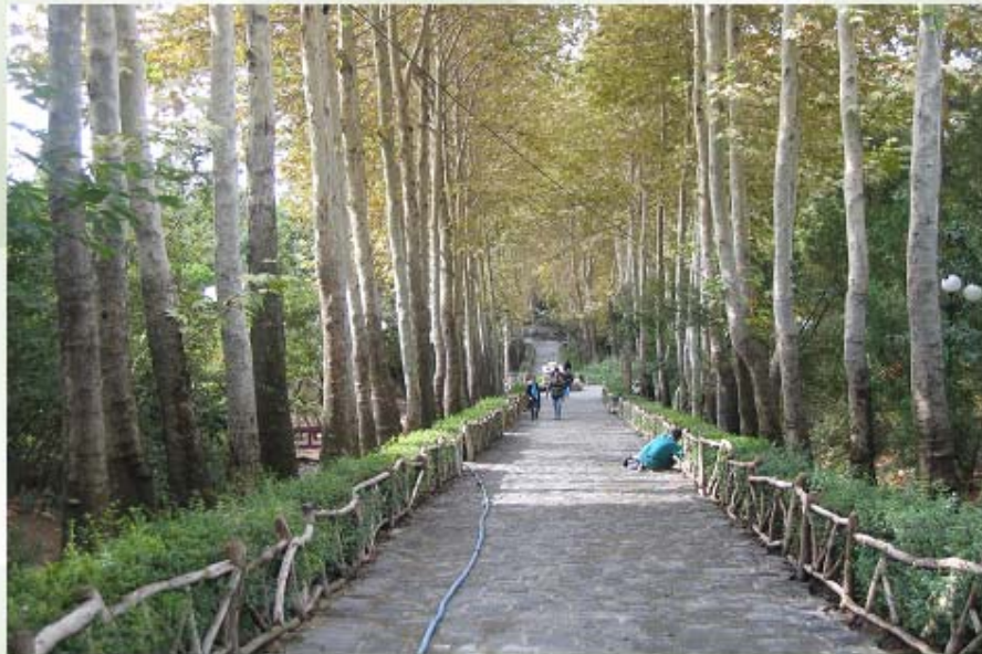
(Tehran, Jamshidieh Park)