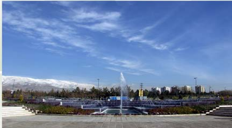
(Tehran, Afra Park)

The meeting endorsed the proposal to launch a process titled “Tehran Process” to pursue and implement the outcome of the Tehran meeting. The first follow up meeting of the “Tehran Process” was held as a side event at the fourth session of the IFF in early February 2000 in New York. On the other hand shortly after the Tehran meeting the LFCCs secretariat was established in November, 2000 to address LFC countries issues, challenges and follow up actions.