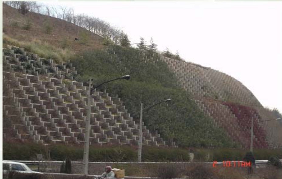
(Tehran, Flowerboxes alongside Modares highway)

IPF and IFF made attempts to draw attention to the particular needs and requirements of LFC countries. In this regard, the open-ended international meeting of experts on special needs and requirements of developing countries with low forest cover and unique types of forests was held in Tehran/ Islamic republic of Iran, from 4 to 8 October 1999.