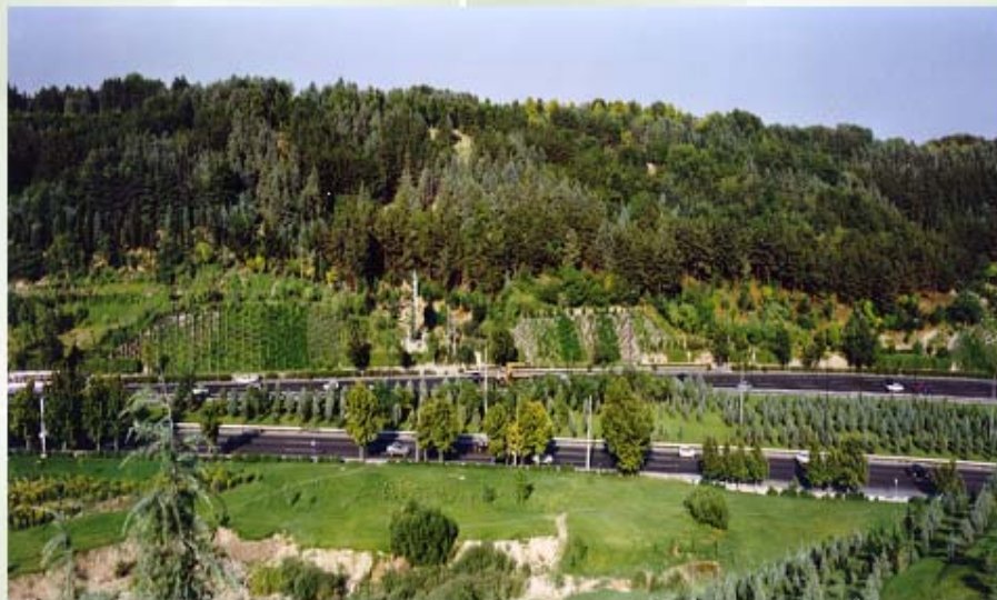
(Tehran, Modarres highway)

Following the workshop on "Sustainable Urban and Peri-urban Forestry and Green Spaces Development in LFCCs of the Near East and Africa: status and the way forward (Tehran, Iran, 7 th – 10 th July 2003)" which was held with cooperation of Tehran Process Secretariat for LFCCs, FAO and hosting and organizing of TPGSO, participants as one of the priority actions, adopted a resolution for establishment of "Regional Center of Excellence " in TPGSO-Tehran to undertake the role of training experts and producing champions in trees, urban and peri- urban forests, city parks and green spaces, as well as to provide services for about 71 members of low forest cover countries. This center is going to provide training courses in Islamic Republic of Iran or in other member countries as appropriate. It is also possible for LFCCs to benefit from