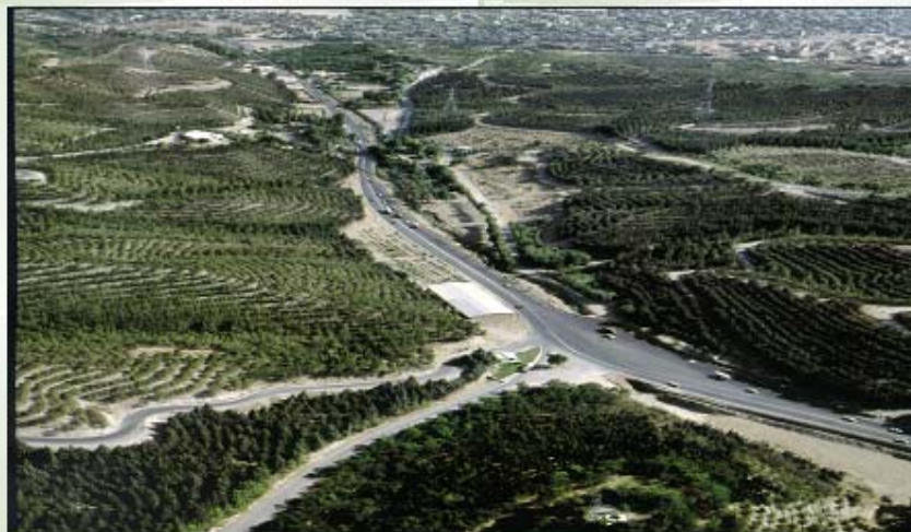
(Tehran, A planted forest)

Workshop on “Sustainable Urban and Peri-Urban forestry and Green Spaces Development in LFCCs—UPUFGS” was