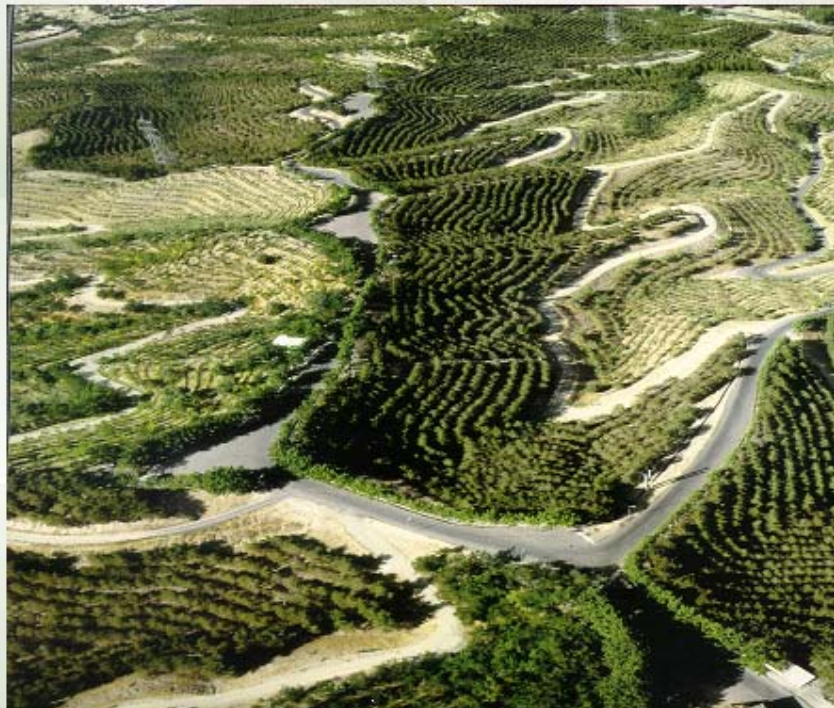
(Tehran, A planted forest)

Provide facilities for member countries to benefit from knowledge and expertise of developed countries without FAO catalyzing.