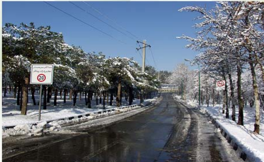
( Tehran, Chitgar park )