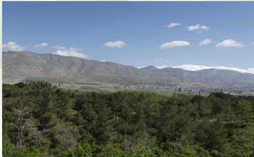
(A planted forest in west of Tehran)

held in Tehran from 7-10 th of July 2003 jointly by TPGSO, Food and Agriculture Organization (FAO) and LFCC's Secretariat as it was suggested in the workshop, 2002, held in Tehran . It aimed at gathering experts from LFCCs and experienced research and education institutions from developed countries to share knowledge and experiences; examine the potential role of urban and peri- urban forestry to address challenges posed by sustainable urbanization and city development, particularly in developing LFCCs in Africa and Near East; increase awareness within LFCCs on the role of forests and trees to mitigate the impacts of rapid and uncontrolled urbanization; recommend appropriate policy and best trees management practices and propose priority actions with regard to national forest programs and preparation of proposals to donor countries.