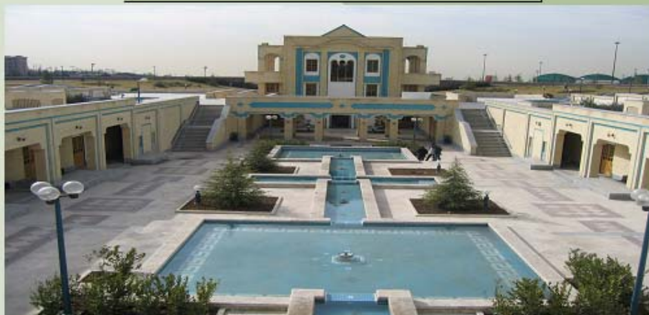
Tehran, Goltogoo Park, a view of center

Municipality of Tehran Urban Services Deputy Tehran Parks & Green Space Organization