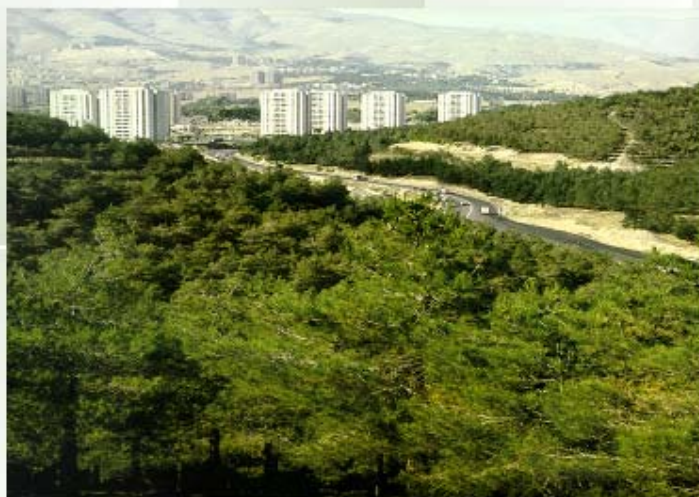
(A planted forest in north of Tehran)

pressure on land use and historical deforestation.