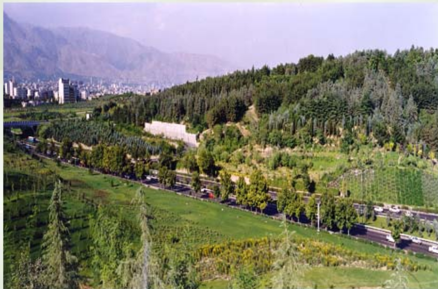
(Tehran, Modarres highway)

Establish a general information bank including the information on international and national responsibilities of the center, list of books, guidelines, textbooks, papers and reports.