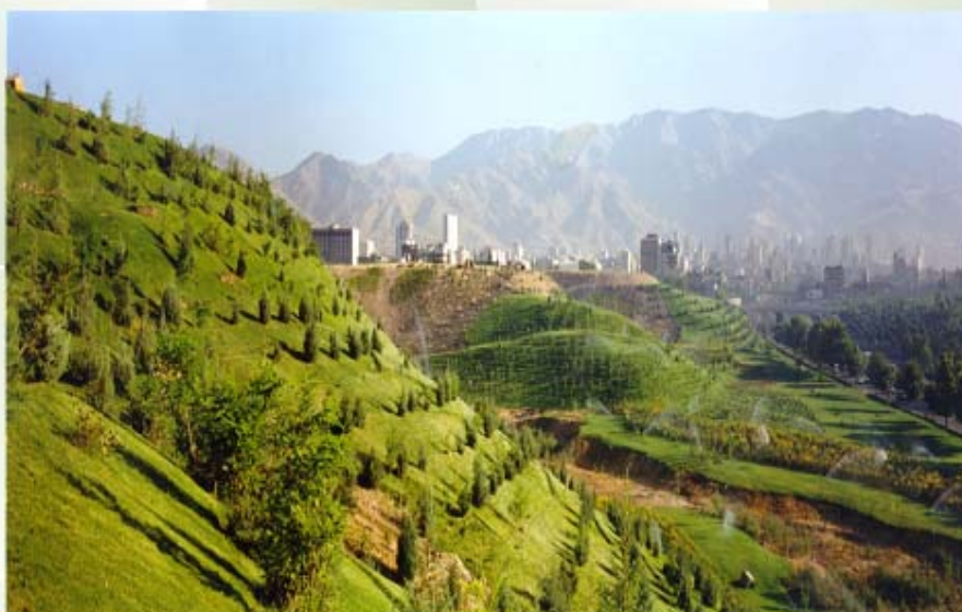
(Tehran, A plantation of Modarres highway)

TPGSO's experiences through Technical Cooperation among Developing Countries (TCDC) projects.