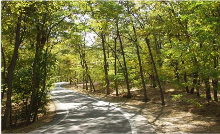
(Tehran, Chitgar park)