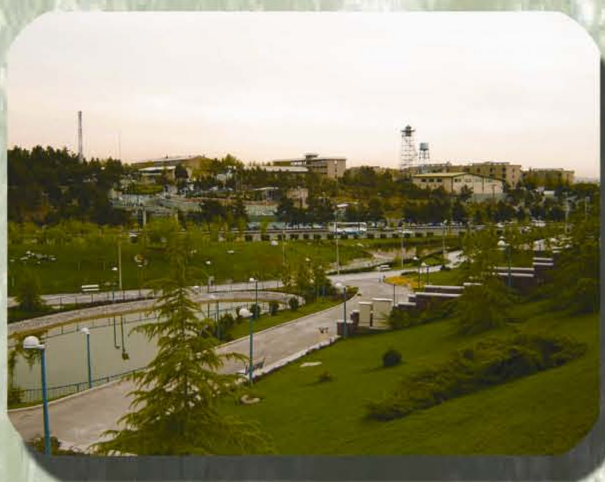
(Tehran, Goftogoo park)

TEHRAN PARKS & GREEN SPACE ORGANIZATION 2006